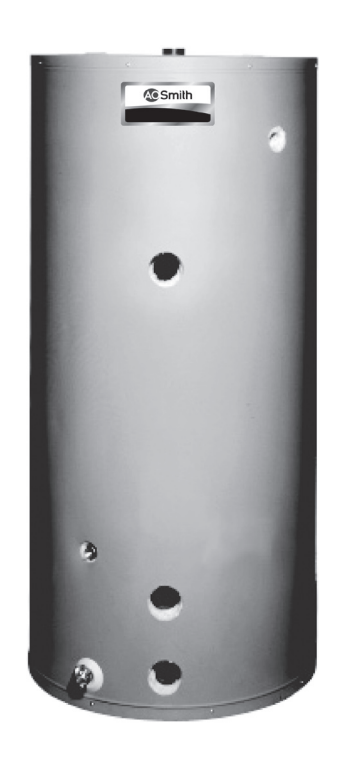
120 Gallon Model